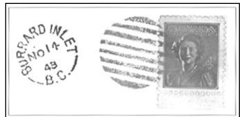
Burrard Inlet Post Mark