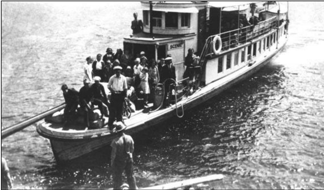
City of Vancouver Archives (CVA Bo P182)